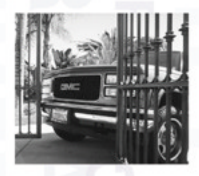
The reversing sensor is standard in all CSW-200™ Series gate operators.