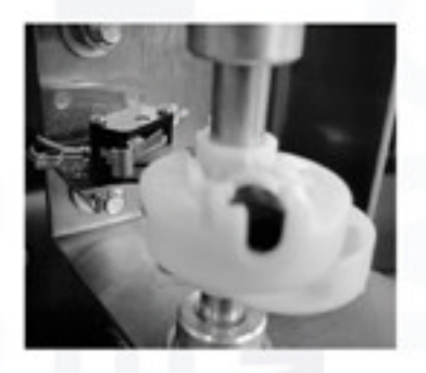
The CSW-200-UL™ limit switch system uses high speed ball bearings.