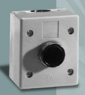
MODEL: A-EXIT P™