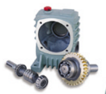
Two, highly efficient, extremely quiet, 30-to-1 gear reducers are used.

Elite's operators are skillfully crafted in the USA. Every unit is carefully inspected both electronically and mechanically to provide the quality expected. Elite uses computer aided design to assure the most precise fit for their operator components. High quality and years of proven reliability places Elite CSW Series swing gate operators ahead of the competition.