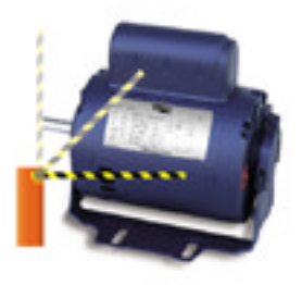
The 1/2 HP, instant reversing parking gate motor uses high speed ball bearings for a smooth and quiet operation.